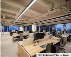
CORE Workplace360, West Los Angeles