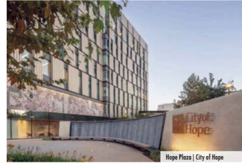
Hope Plaza | City of Hope