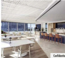
Confidential Law Firm