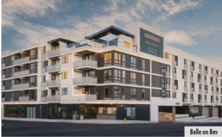
Belle on Bev