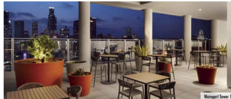
Weingart Tower I