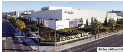
The Shops at Hollywood Park