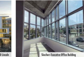
Skechers Executive Office Building