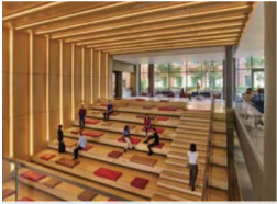
USC Dr. Allen and Charlotte Ginsburg Human-Centered Computation Hall