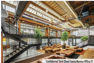
Confidential Tech Client Santa Monica Office II