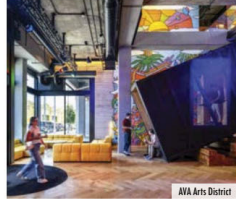
AVA Arts District