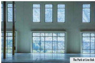
The Park at Live Oak