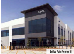
Bridge Point Vernon III