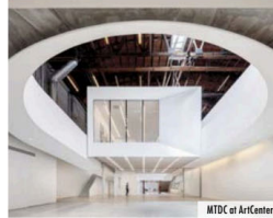
MTDC at ArCenter